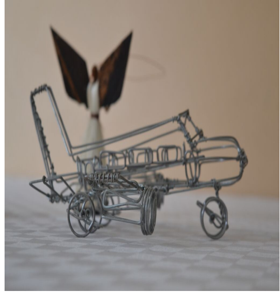
Figure 8: A charm - Like the airplane flies up high we are also destined to fly high as children