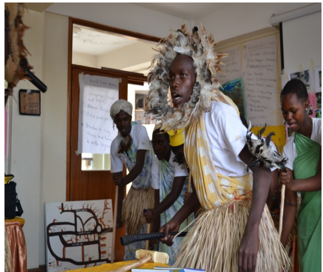
Figure 12: We are the voice of the voiceless. We say no to Child abuse. (KA2000, Traditional Dance)