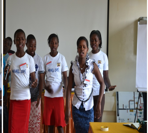
Figure 4: Laare Waumini SACCO Chosen Ones present a song prohibiting retrogressive cultural practices: FGM and early marriages