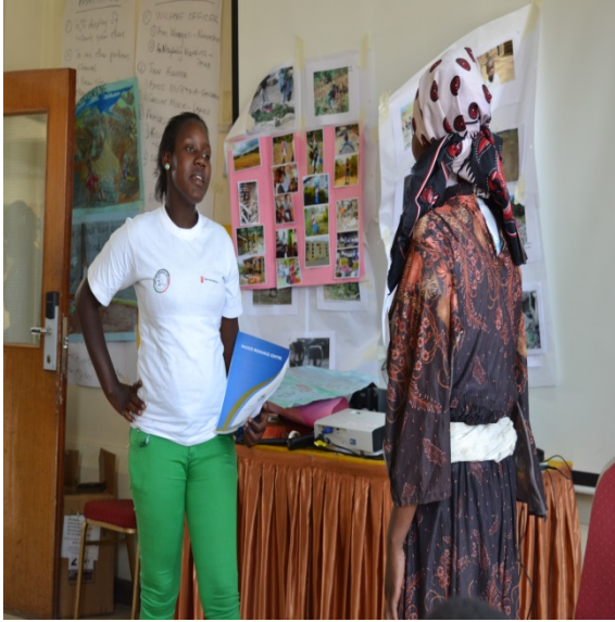
Figure 7: KA2000 chosen ones present a drama discouraging FGM and Girl child exploitation