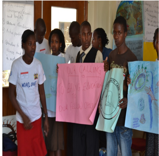
Figure 10: Our Calling is to bring Education – Life Skills – to our fellow children. (KA2000)