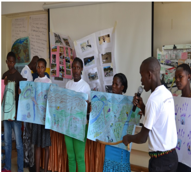
Figure 11: Our community is rich and fertile for agricultural work. Our problem is the Green Gold (Miraa).