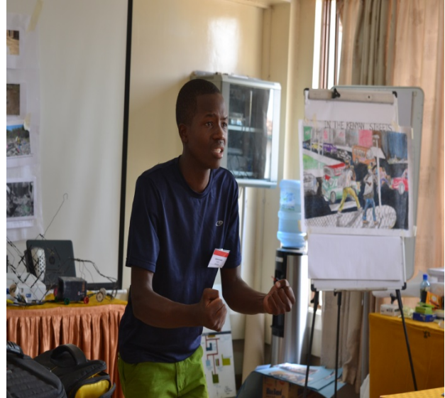
Figure 6: Deprived of my childhood, overloaded with work, burdened with responsibilities at school age, with so much to learn, so much to accomplish, but not given enough time. (Hamaton)

We the Laare Catholic Waumini SACCO Chosen One's our call is to bring dignified work to all children. This is what brought us together for social support but also for economic empowerment. The Groups have been registered with the government ministries and the members can access loans from the government at very low interest rates. We will share our challenges and achievements through drama and poems.