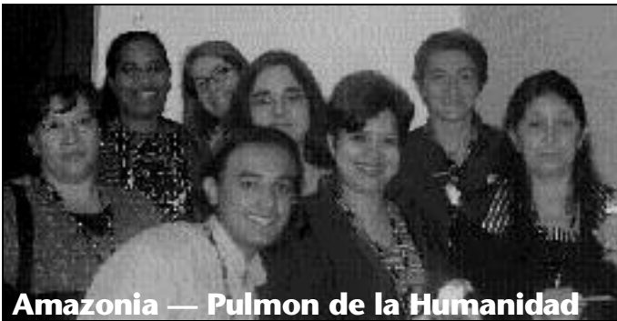
Amazonia — Pulmon de la Humanidad

FOR THE REST OF THIS ARTICLE, AND OTHERS, VISIT: WWW.TGMAG.CA/CIVICUS/